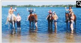
horse surfing beachhorses.com

For exciting updates, free late-breaking stuff for parents and families, and tons of practical and fun information, join us on Facebook!