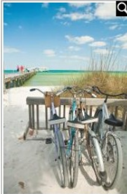
area convention & visitors bureau